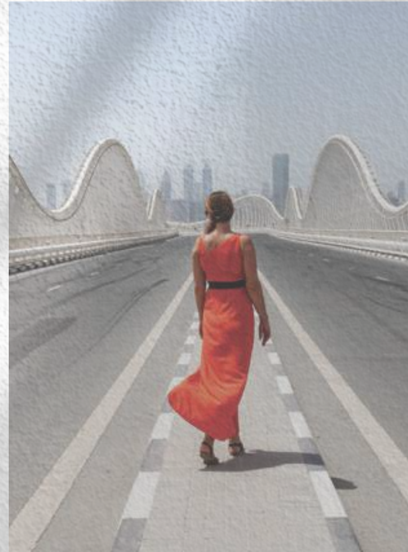
Exterior Community View

Together, the glass facade and layered terraces give the building a unique identity, setting a new standard for architecture in this exclusive area.